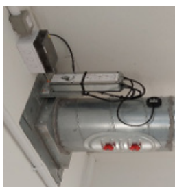
Motorised fire damper