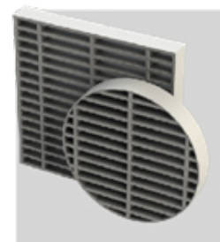
Intumescent fire damper

SFG20, the definitive standard for planned maintenance, sets out the specific actions required. These are summarised as follows: